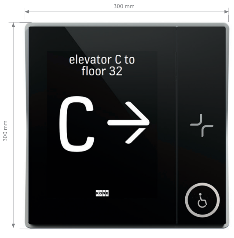
10.4" capacitive touchscreen with high-quality glass faceplate

Short and long range proximity sensor with timer saves energy while prolonging the lifetime of the device