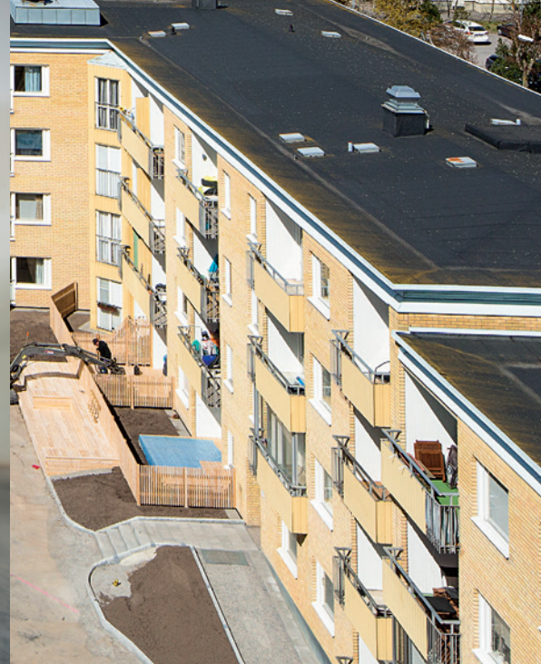
The residential building in Eskilstuna.