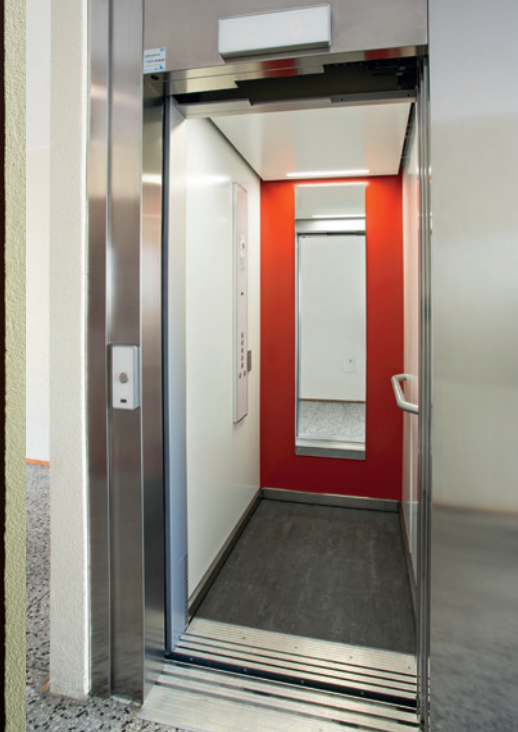
KONE MonoSpace® after modernization.