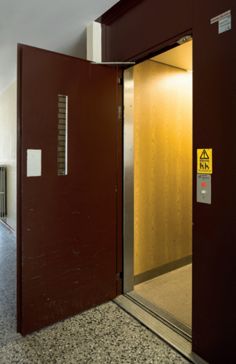
Old elevator before modernization.